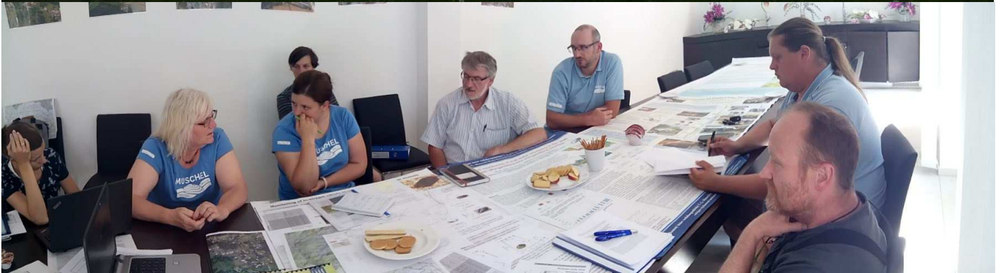
5 th June 2018 - Internal water chemistry meeting in Dolní Dvořiště, Czech and Austrian partners, together with government representatives of both countries.